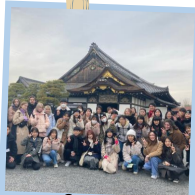
One-day Kyoto Study Trip