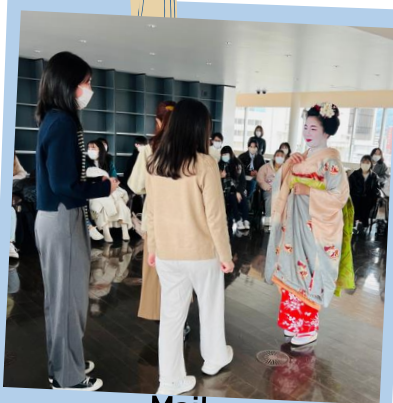
Maiko Culture Experience